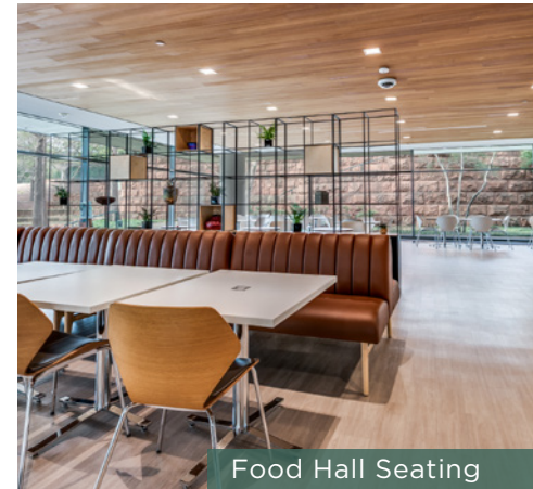
Food Hall Seating