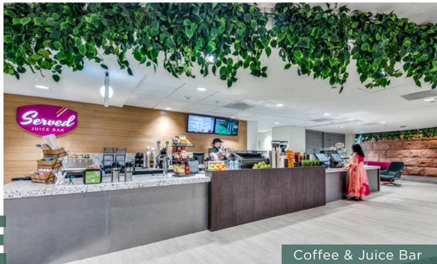
Coffee & Juice Bar