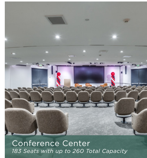
Conference Center 183 Seats with up to 260 Total Capacity