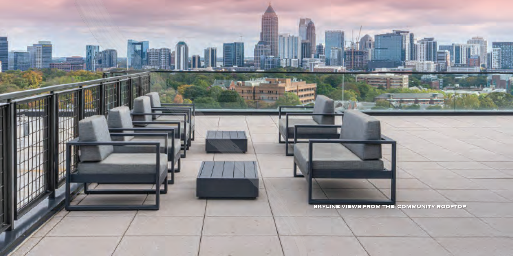
SKYLINE VIEWS FROM THE COMMUNITY ROOFTOP

PLUS, THIS VIEW MAKES FOR A SUPERB BACKDROP TO COMPANY EVENTS (& DAILY LUNCHES)