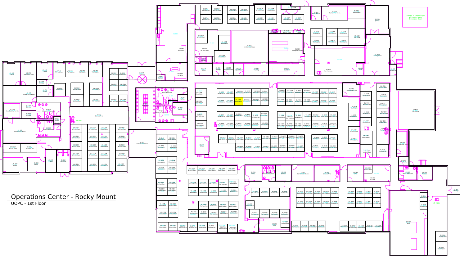
Operations Center - Rocky Mount UOPC - 1st Floor