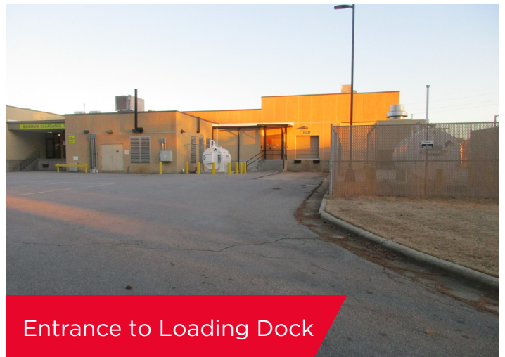
Entrance to Loading Dock