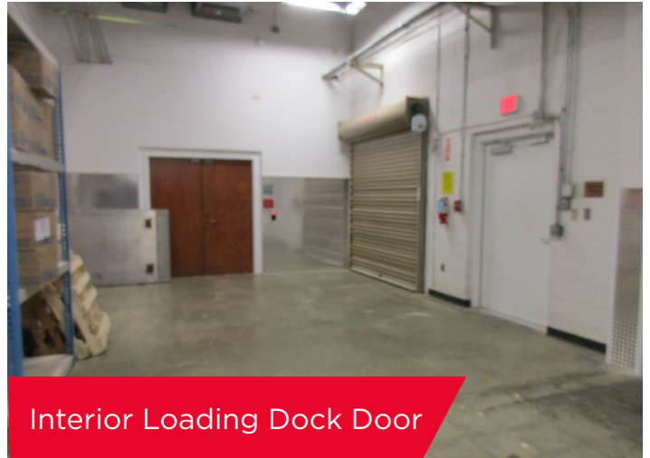
Interior Loading Dock Door