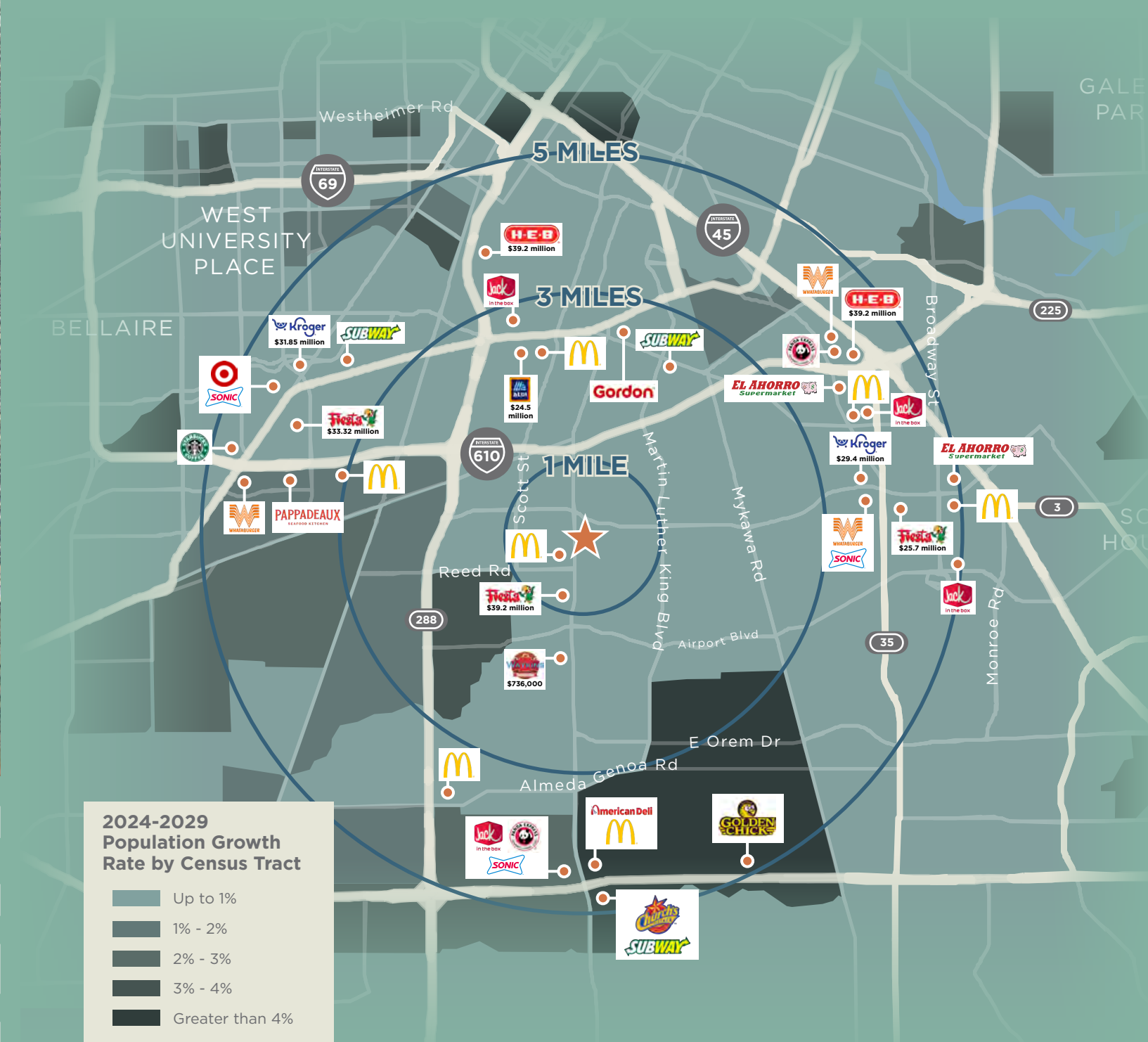
2024-2029 Population Growth Rate by Census Tract

Located in a Houston submarket seeing an increased demand for healthcare services with favorable housing and population growth, Bellfort Plaza presents a prime opportunity for new healthcare tenants to serve a community expected to grow by nearly 9,000 residents and 6,000 housing units over the next four years.