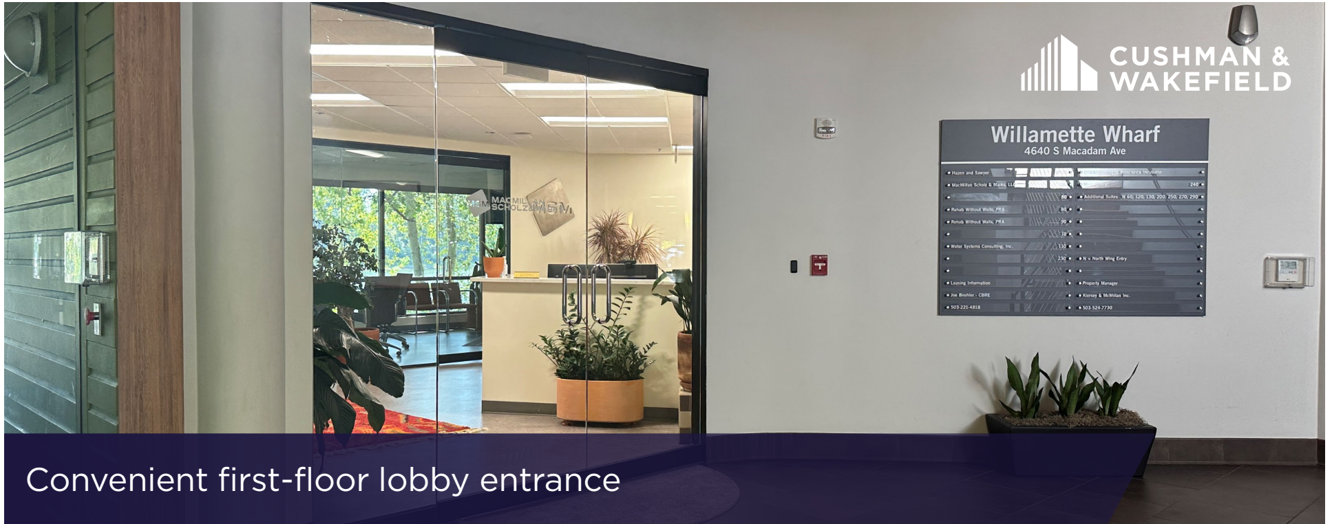
Convenient first-floor lobby entrance