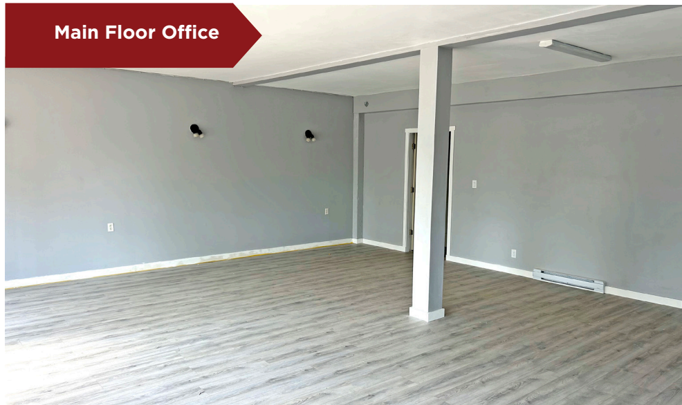
Main Floor Office