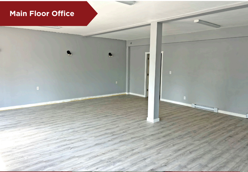
Main Floor Office