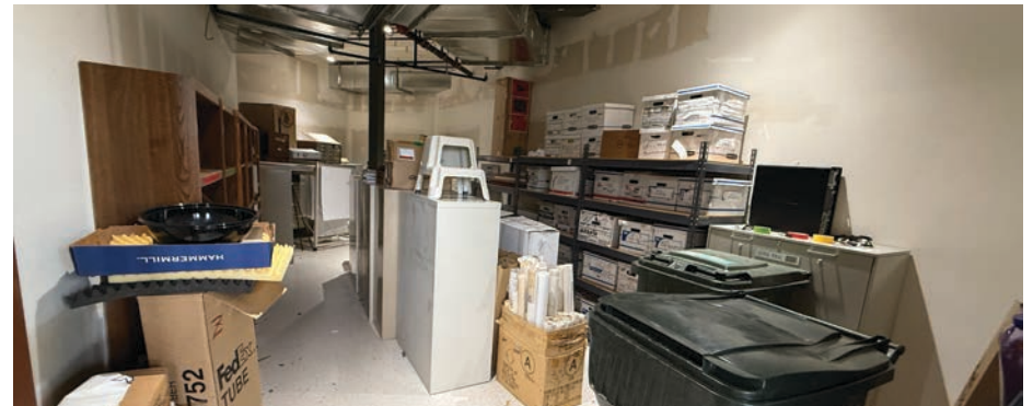
ADDITIONAL STORAGE SPACE (SECOND FLOOR)