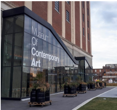
MUSEUM OF CONTEMPORARY ART