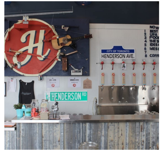
HENDERSON BREWING CO