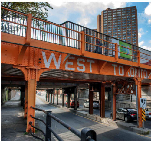
WEST TORONTO RAIL PATH