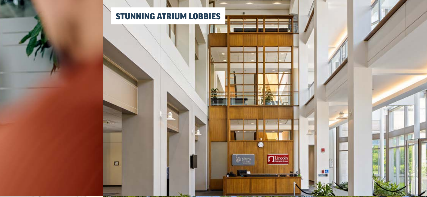
STUNNING ATRIUM LOBBIES