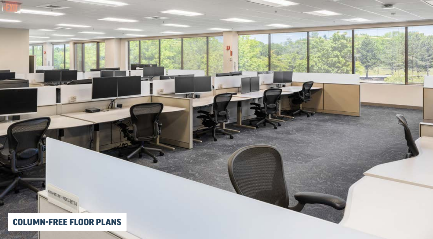
COLUMN-FREE FLOOR PLANS