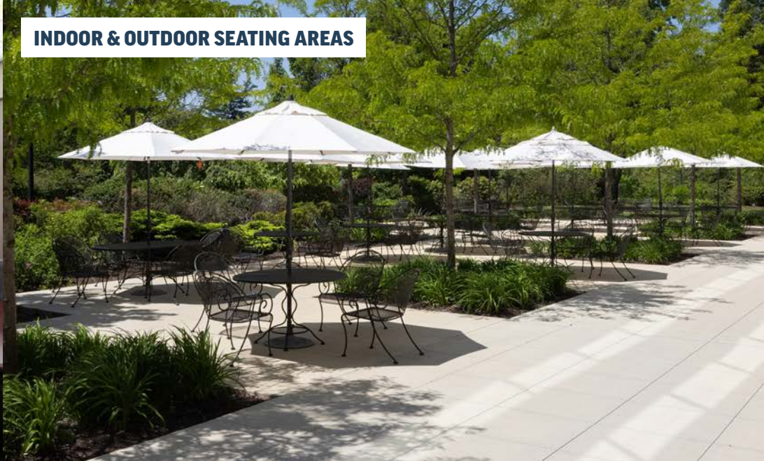
INDOOR & OUTDOOR SEATING AREAS