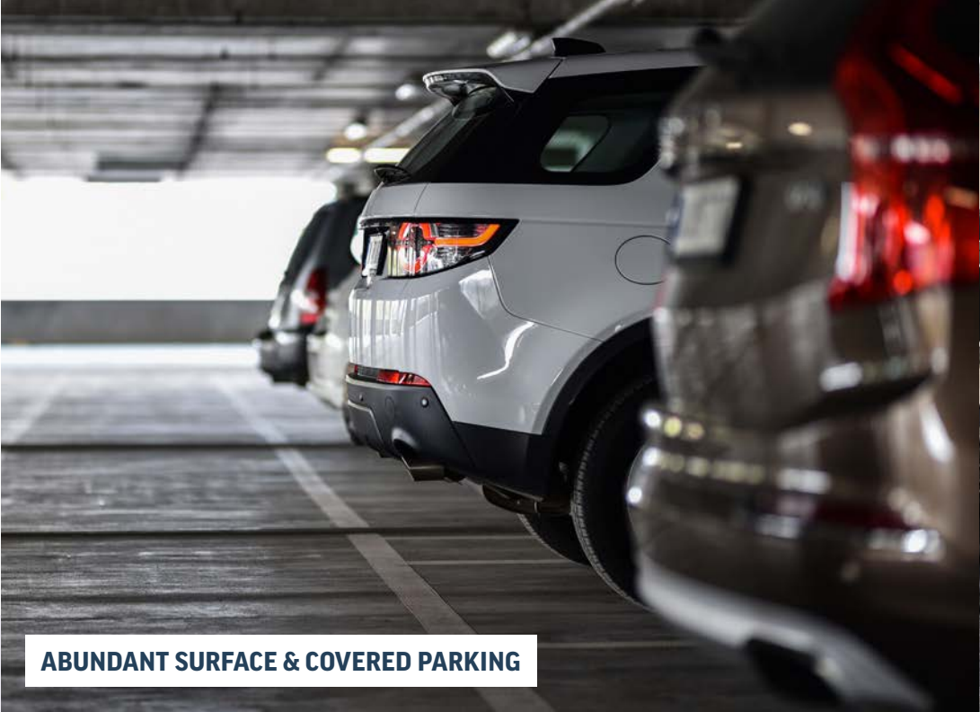
ABUNDANT SURFACE & COVERED PARKING