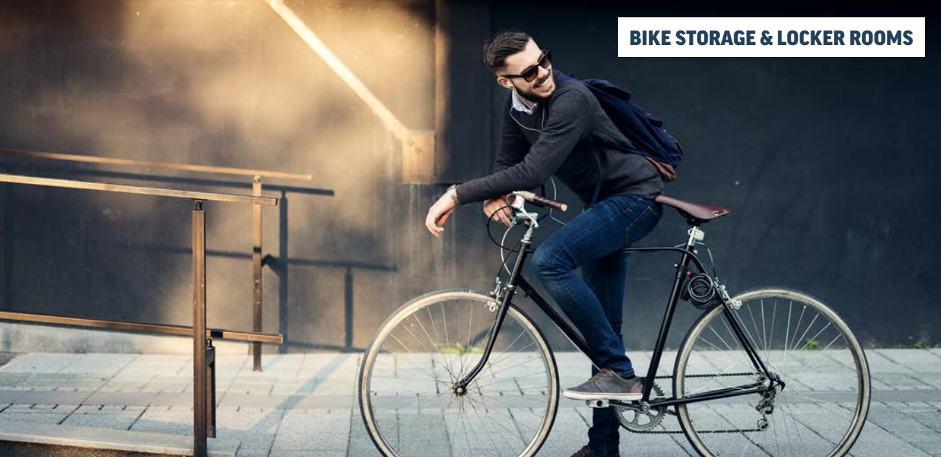
BIKE STORAGE & LOCKER ROOMS