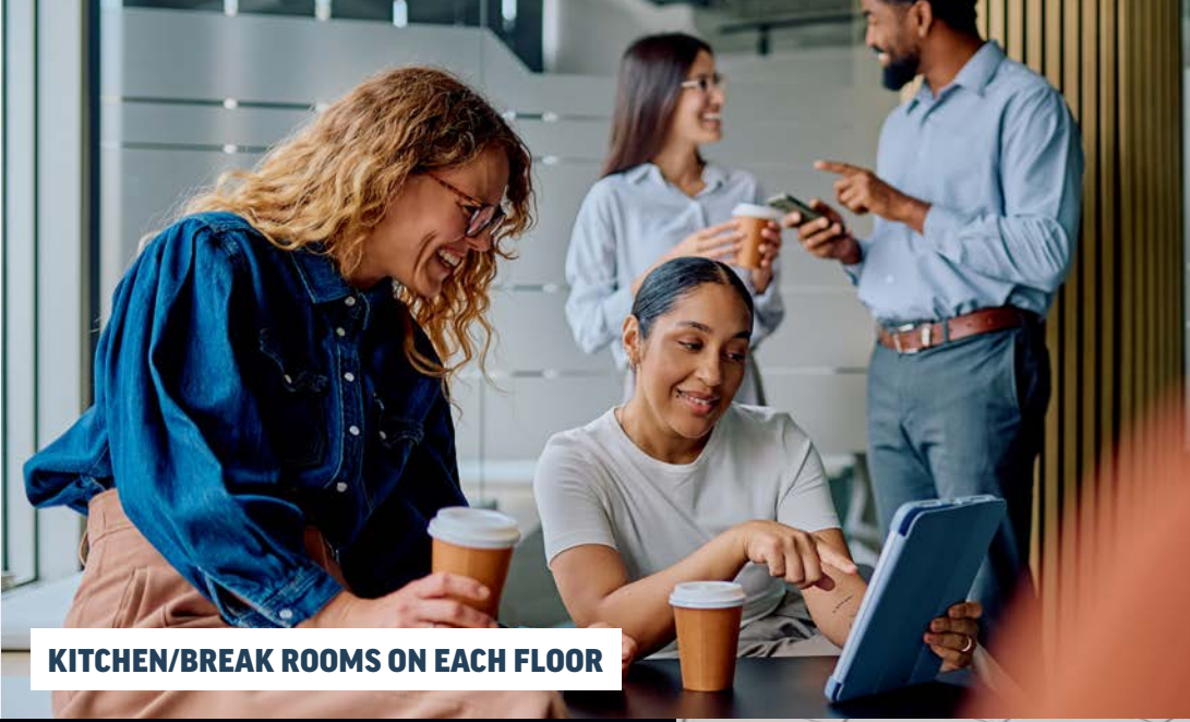
KITCHEN/BREAK ROOMS ON EACH FLOOR