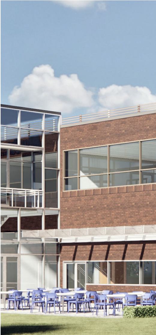
CONCEPTUAL EXTERIOR RENDERING