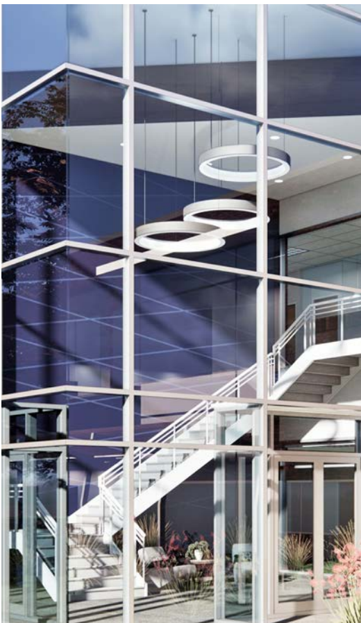
CONCEPTUAL EXTERIOR RENDERING