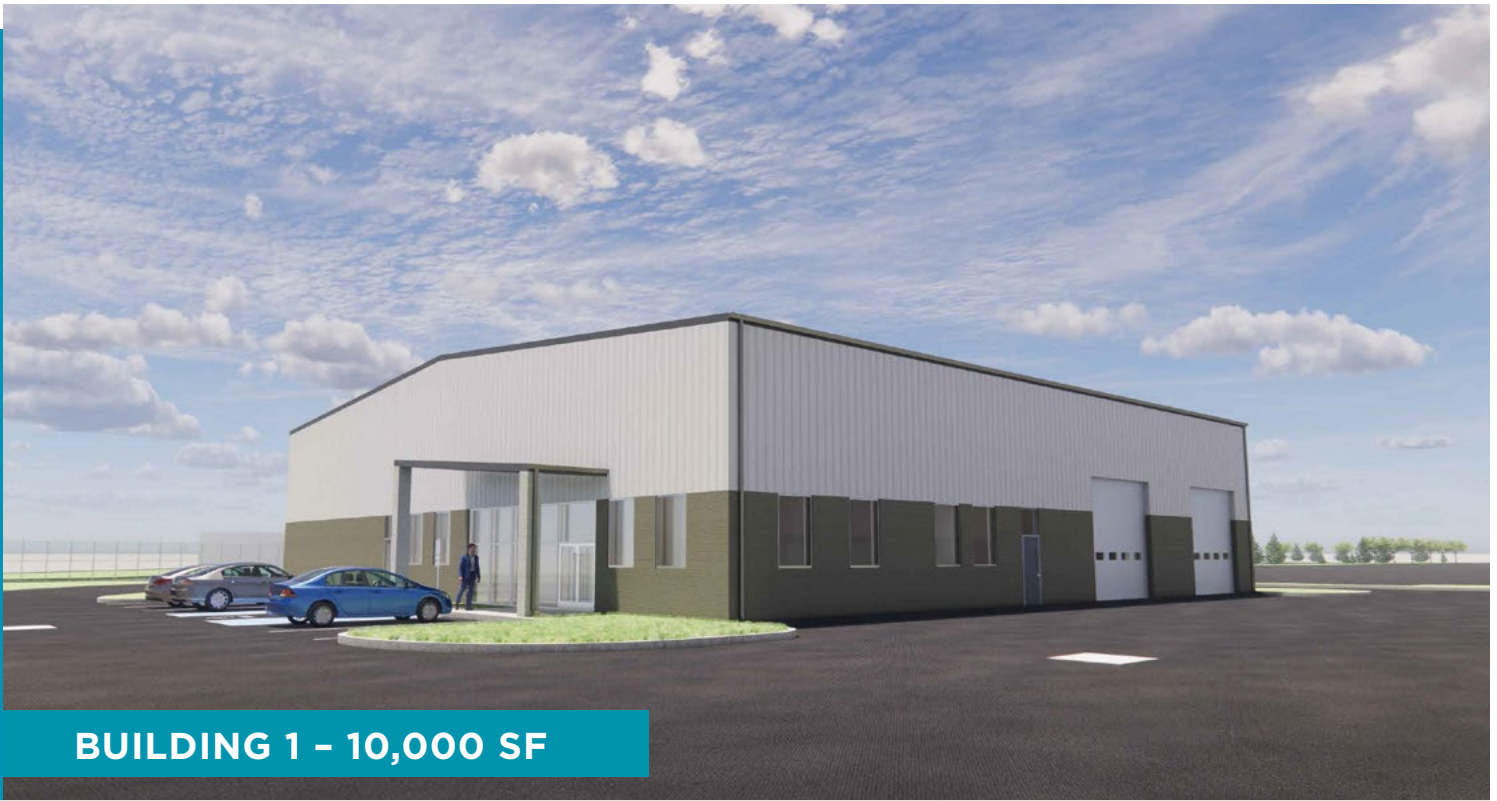
BUILDING 1 - 10,000 SF

PRIME LOCATION IN NORTH COLUMBUS EASY ACCESS TO STATE AND INTERSTATE HIGHWAYS