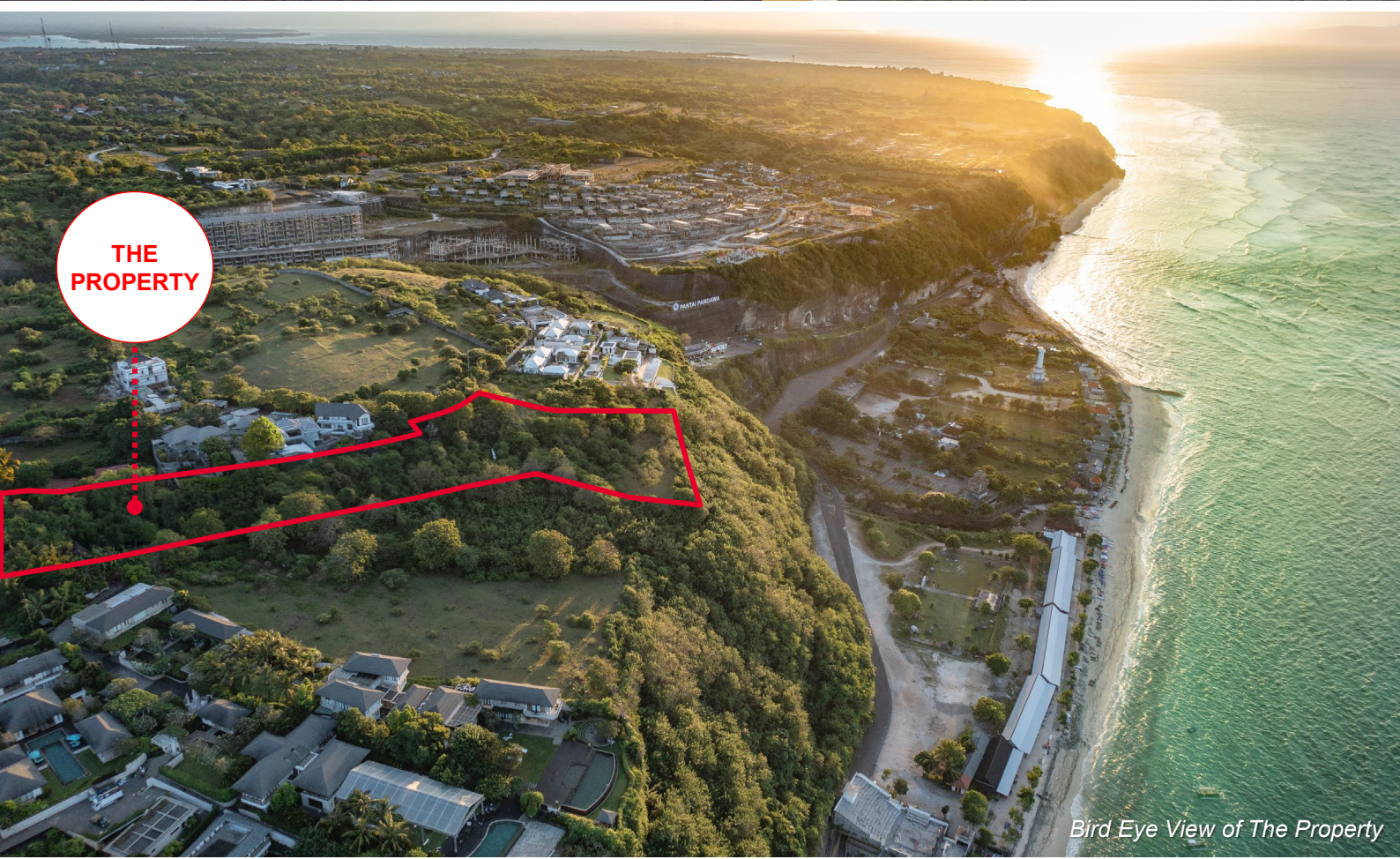
Bird Eye View of The Property