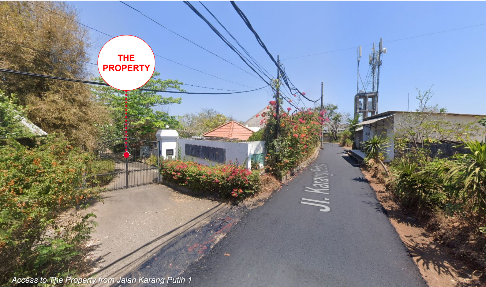
Access to The Property from Jalan Karang Putih 1