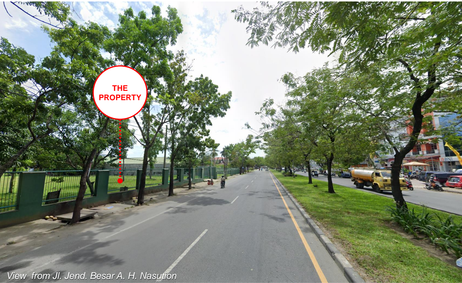
View from Jl. Jend. Besar A. H. Nasution