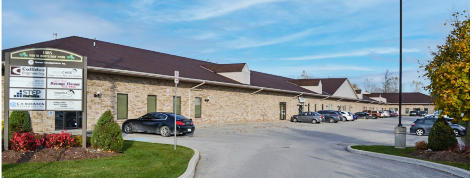
SITE PLAN | 1385 NORTH ROUTLEDGE PARK