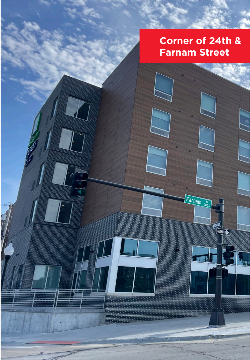
Corner of 24th & Farnam Street