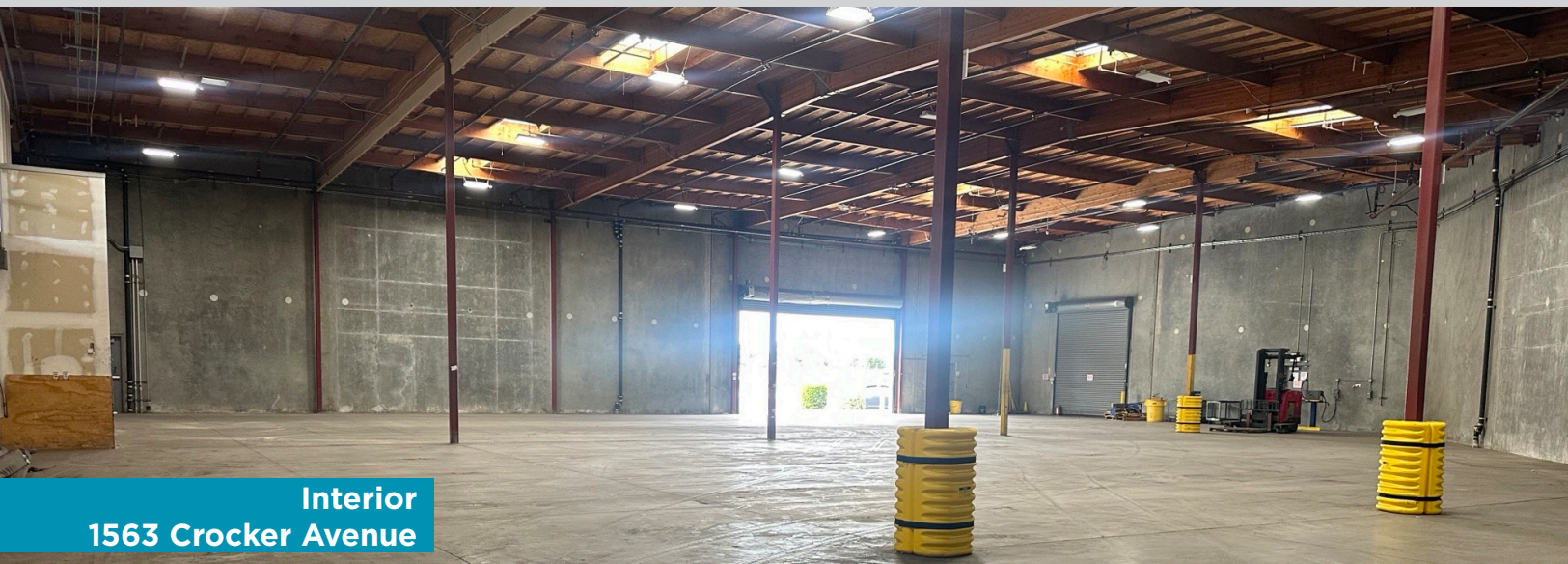
Interior 1563 Crocker Avenue