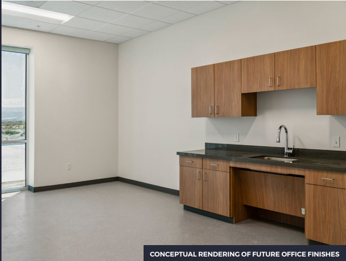
CONCEPTUAL RENDERING OF FUTURE OFFICE FINISHES