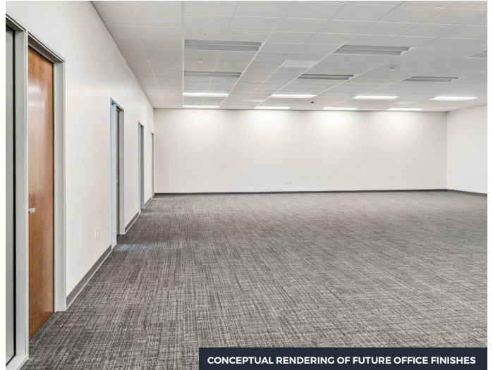
CONCEPTUAL RENDERING OF FUTURE OFFICE FINISHES