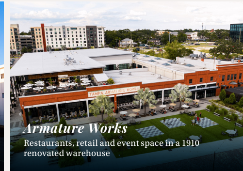
Armature Works Restaurants, retail and event space in a 1910 renovated warehouse