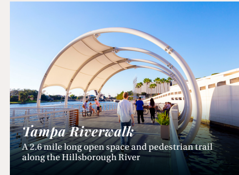
Tampa Riverwalk A 2.6 mile long open space and pedestrian trail along the Hillsborough River

Ashley Plaza is located within a bustling, central business district where work life is complemented by rich opportunities for after-hours downtime.