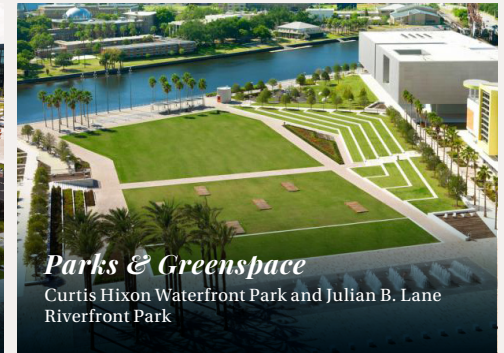
Parks & Greenspace Curtis Hixon Waterfront Park and Julian B. Lane Riverfront Park