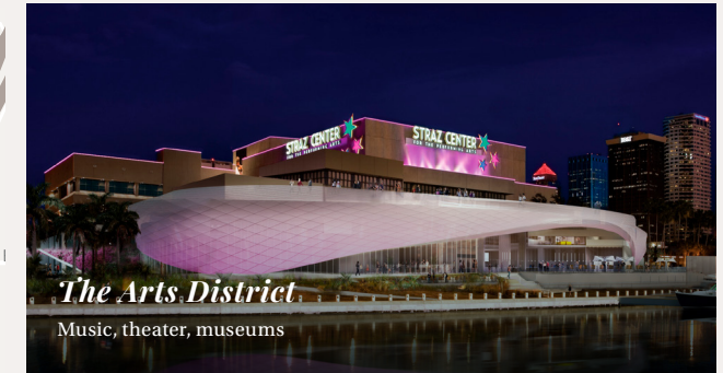
The Arts District Music, theater, museums