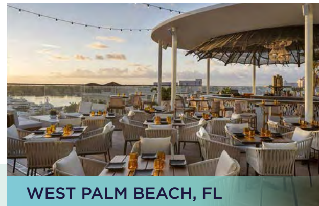
WEST PALM BEACH, FL