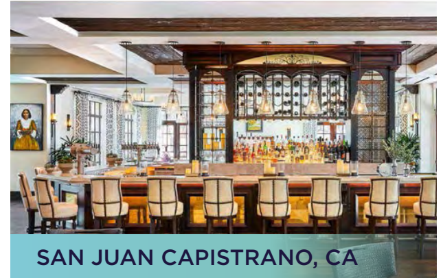
SAN JUAN CAPISTRANO, CA