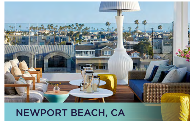
NEWPORT BEACH, CA