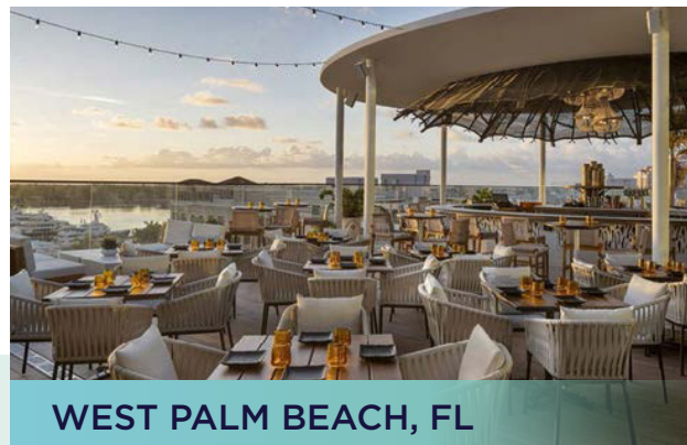
WEST PALM BEACH, FL