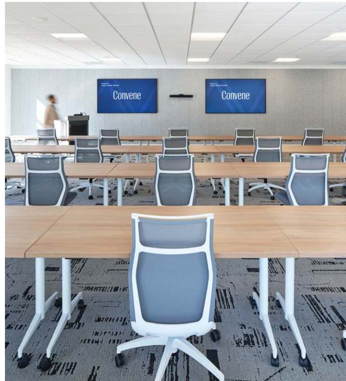
FROM TRAINING SPACES