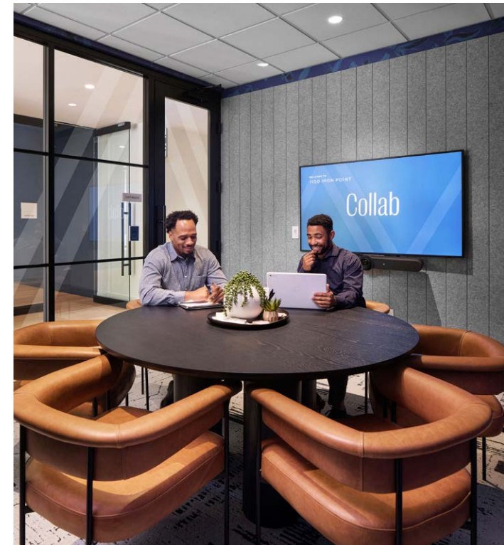
TO DIVERSE MEETING PLACES