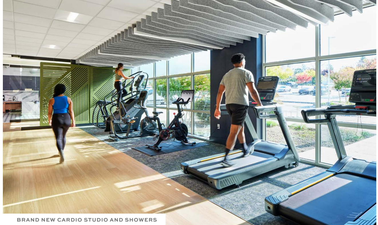
BRAND NEW CARDIO STUDIO AND SHOWERS

It's a place where employees can exercise, relax, and rejuvenate amidst nature's beauty.