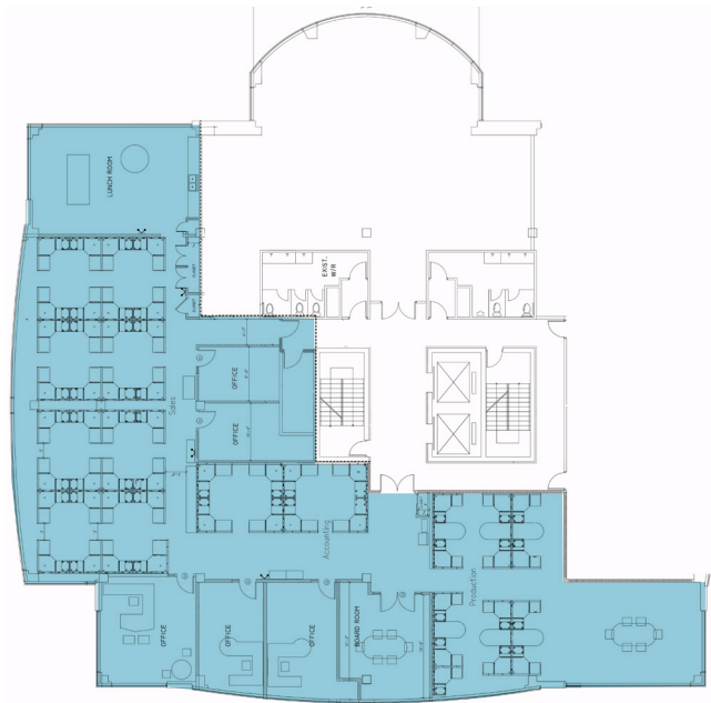
Suite 401 - 7,591 SF

For more information, contact the Listing Agents: