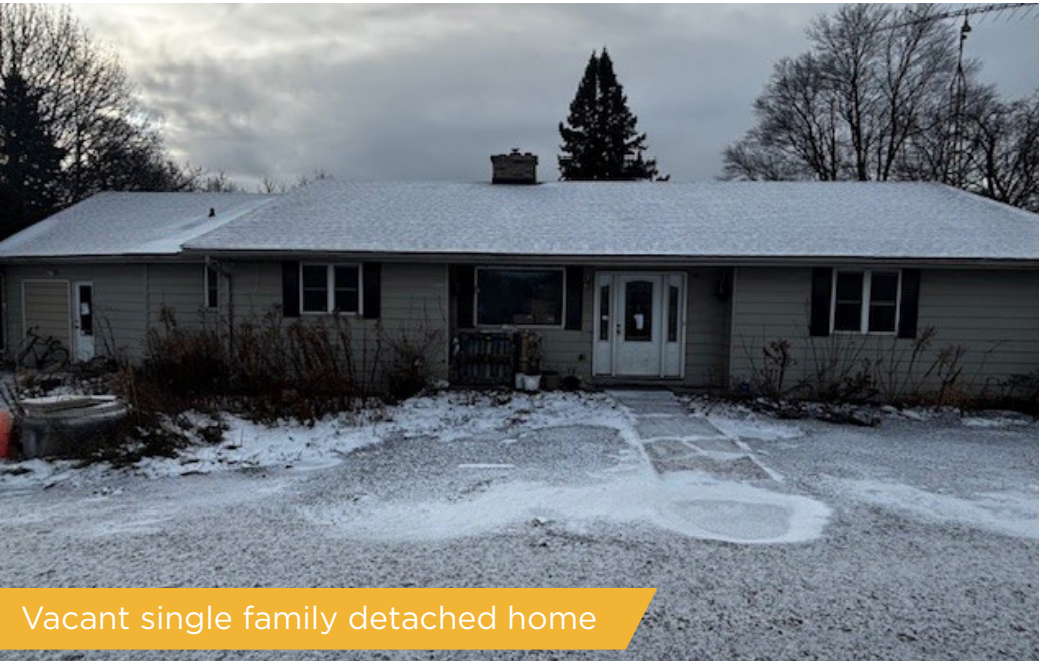
Vacant single family detached home