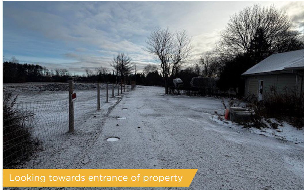
Looking towards entrance of property