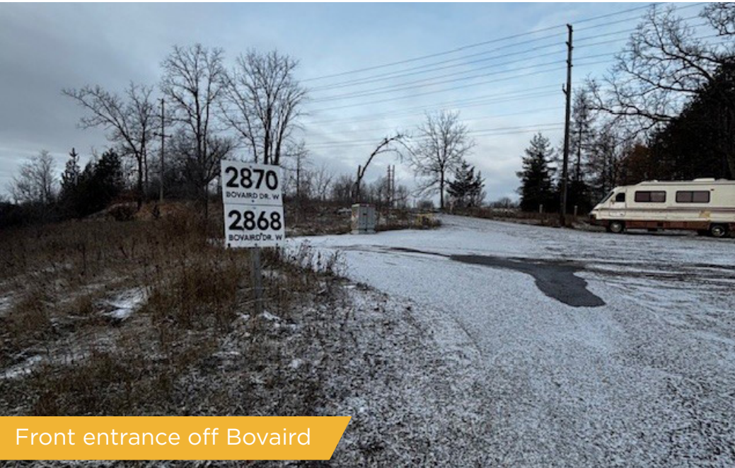
Front entrance off Bovaird