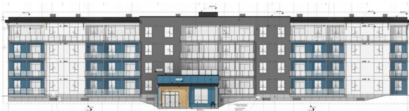
BLOCK A - SOUTH ELEVATION