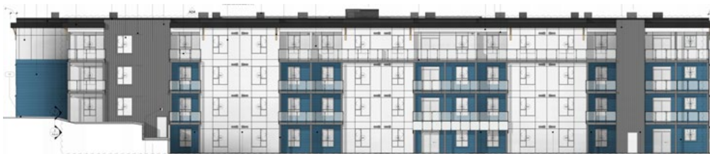
BLOCK A - NORTH ELEVATION