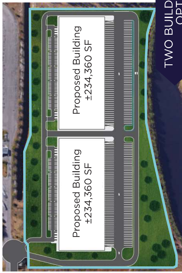
TWO BUILDING OPTION