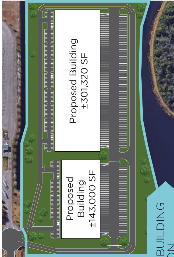
TWO BUILDING OPTION