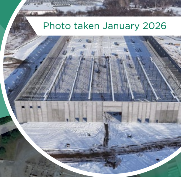
Photo taken January 2026