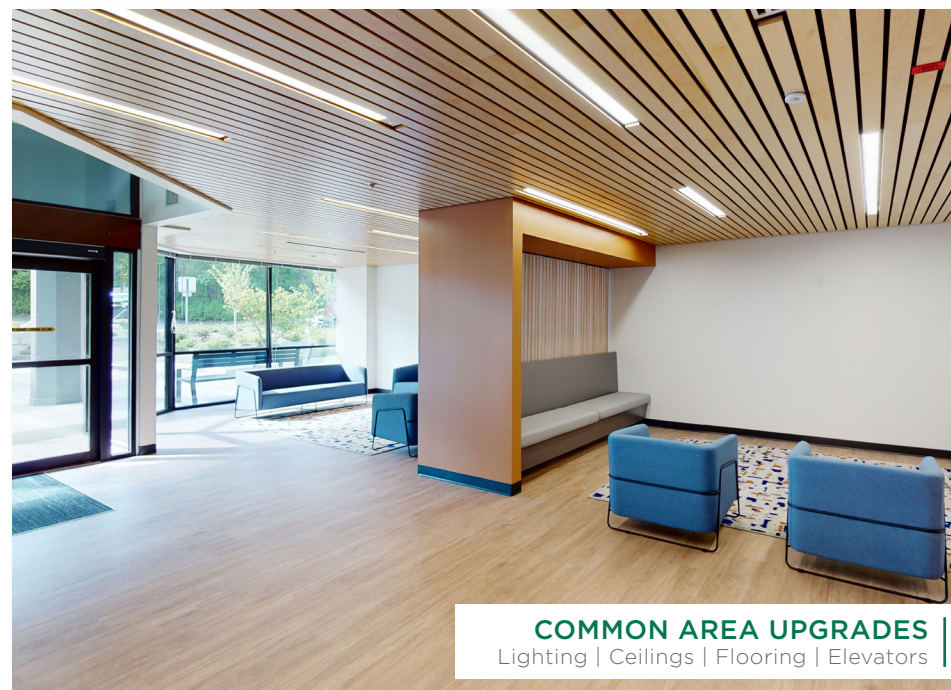
COMMON AREA UPGRADES Lighting | Ceilings | Flooring | Elevators