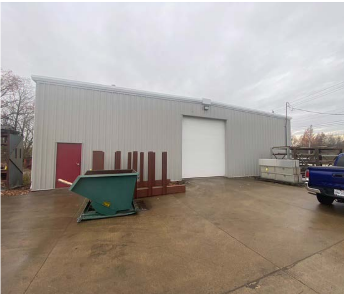
Building B - Exterior West Elevation