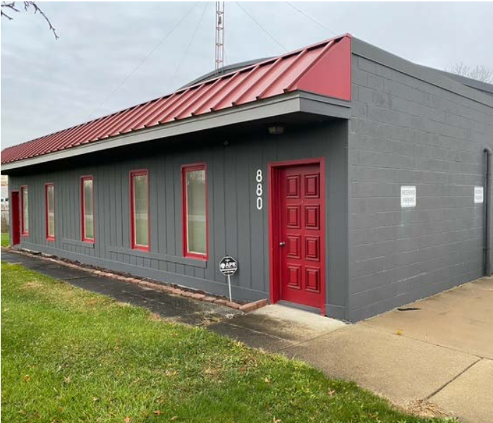
Building A - Exterior North Elevation