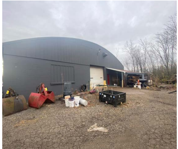
Building A - Exterior South Elevation