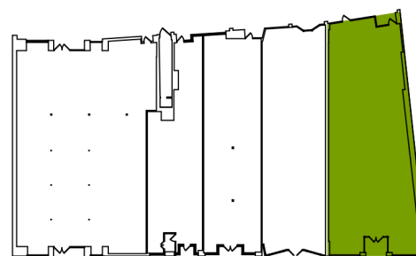
KEY PLAN: NOT TO SCALE