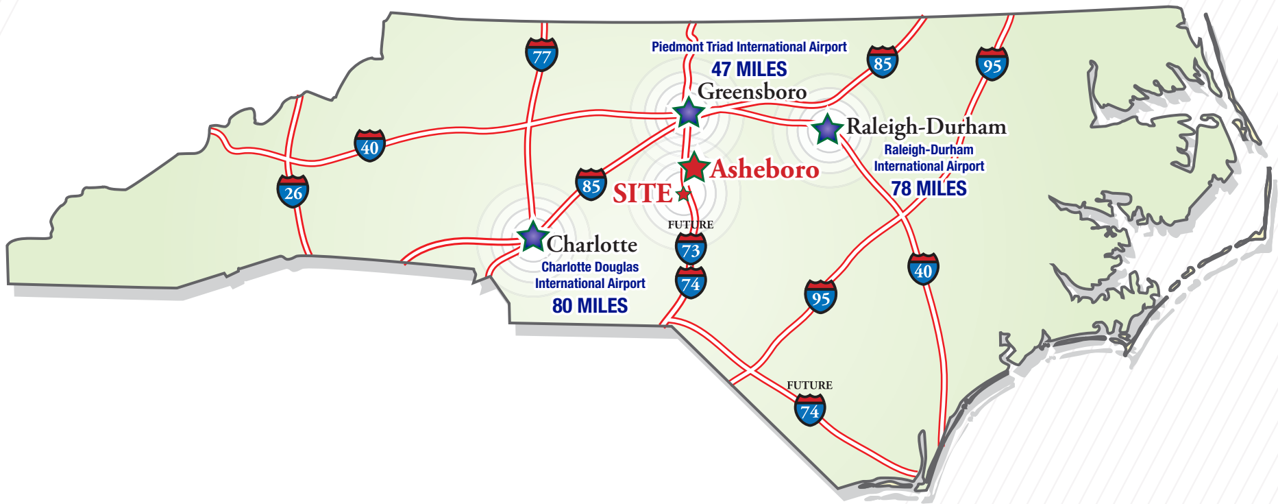
NC Airports Proximity Map

I-74 / I-73 / US 220 & NEW HOPE CHURCH ROAD