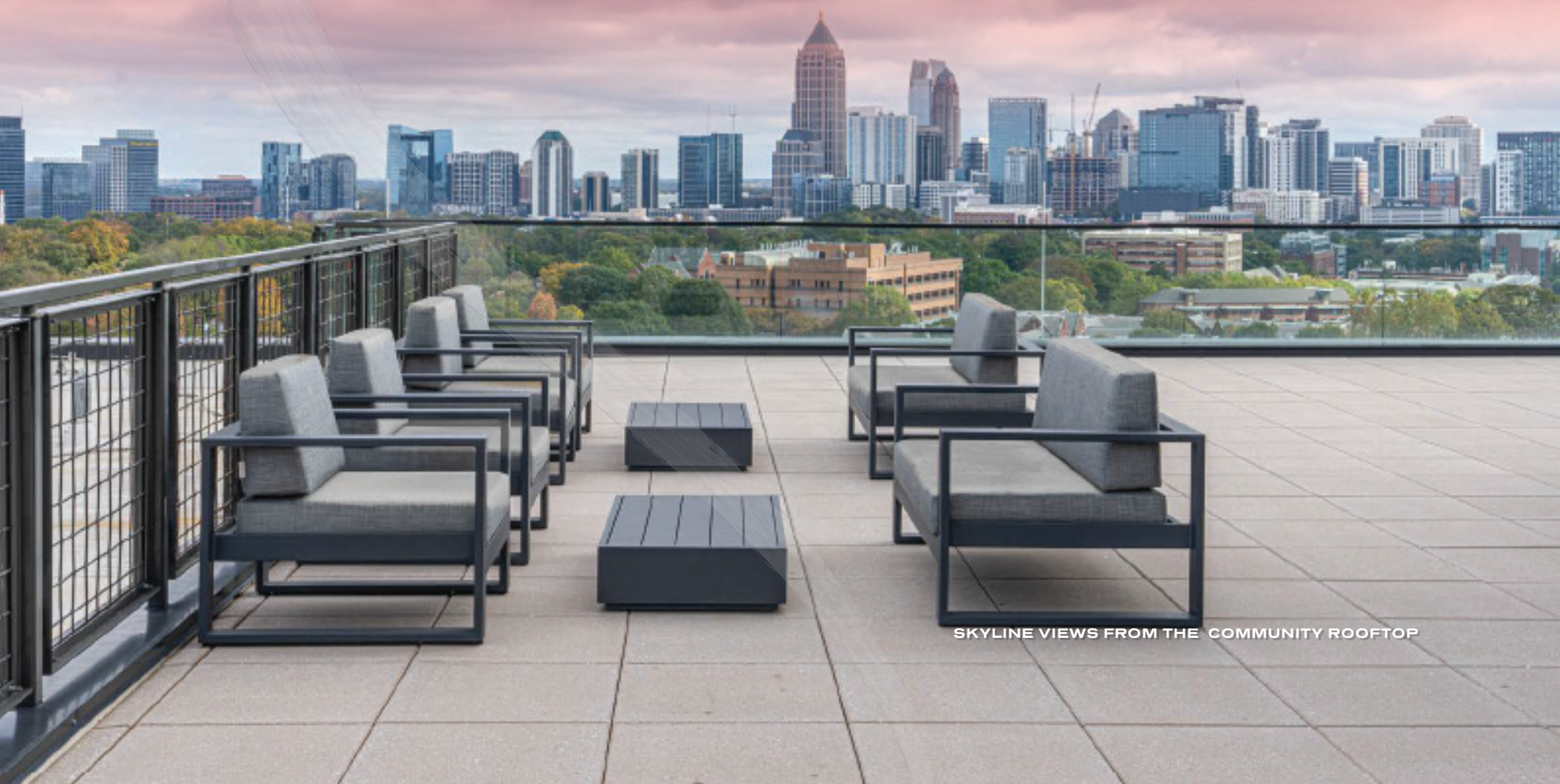
SKYLINE VIEWS FROM THE COMMUNITY ROOFTOP

PLUS, THIS VIEW MAKES FOR A SUPERB BACKDROP TO COMPANY EVENTS (& DAILY LUNCHES)