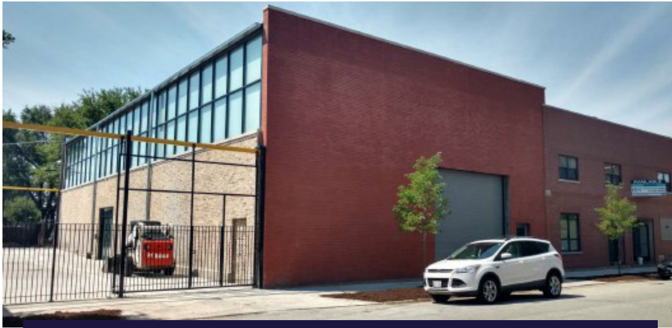
1725 WEST HUBBARD STREET, CHICAGO, IL