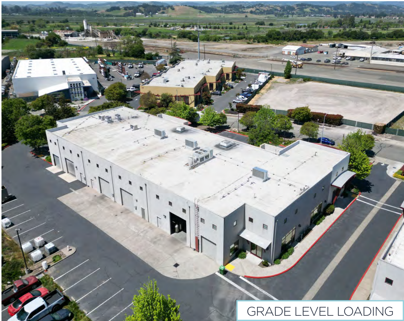
GRADE LEVEL LOADING