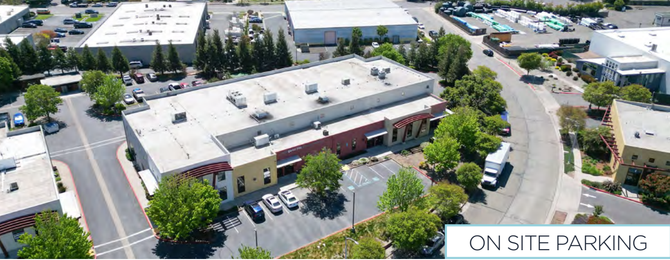
ON SITE PARKING