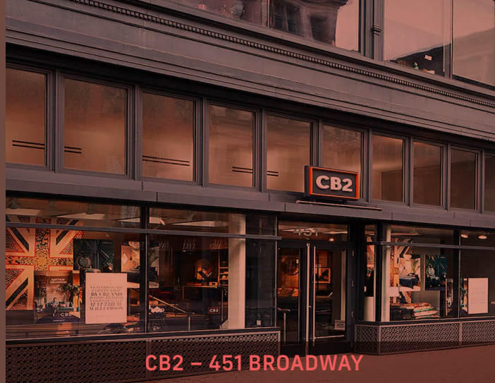
CB2 – 451 BROADWAY