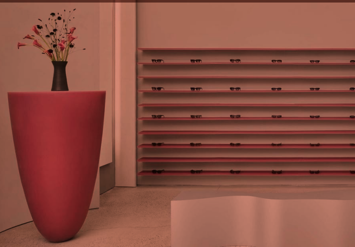
CHIMI – 110 GRAND STREET