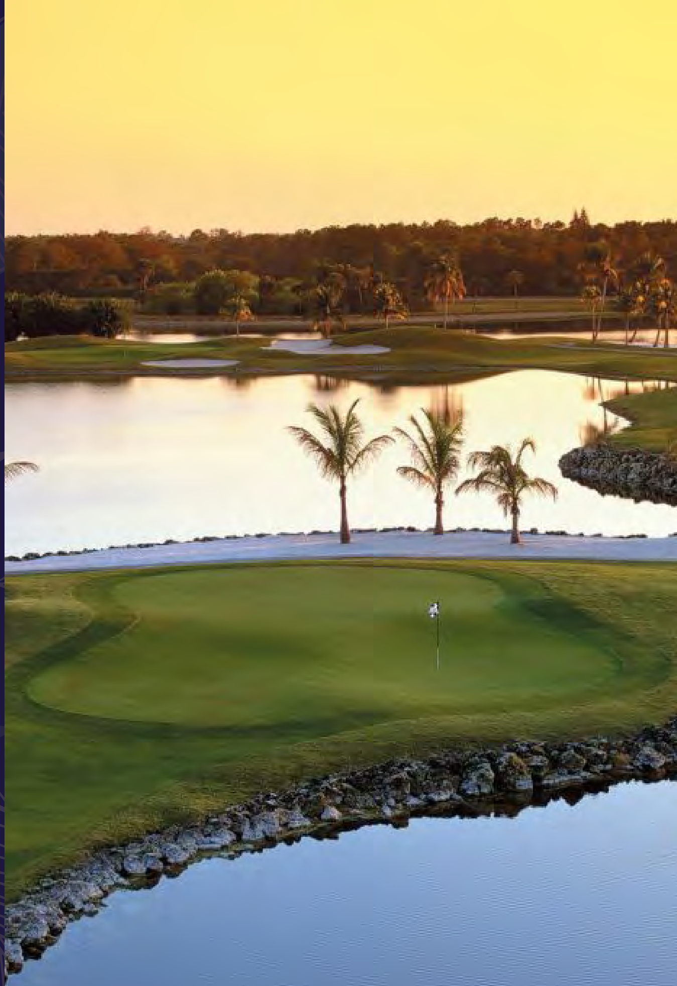
LELY RESORT & GOLF COURSE