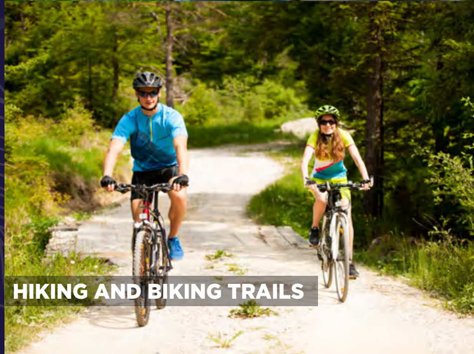
HIKING AND BIKING TRAILS