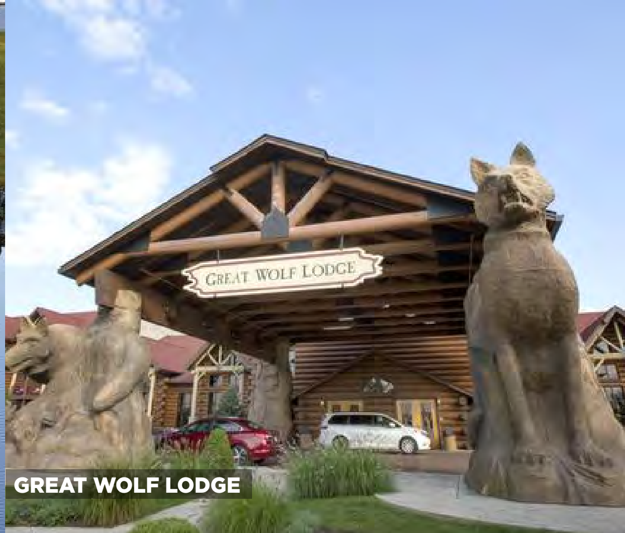
GREAT WOLF LODGE