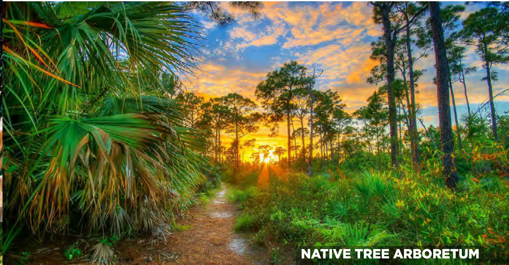
NATIVE TREE ARBORETUM