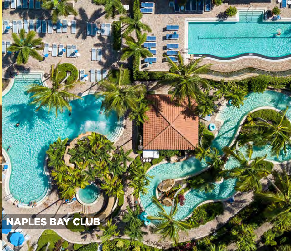
NAPLES BAY CLUB