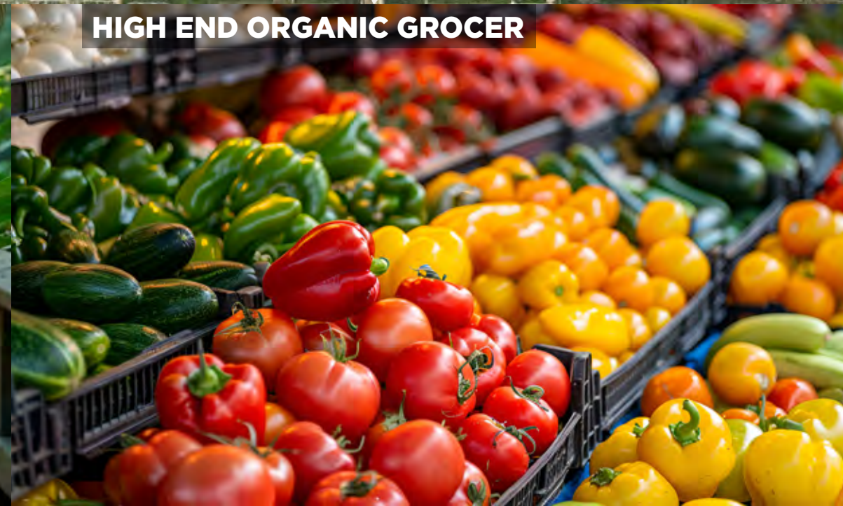
HIGH END ORGANIC GROCER