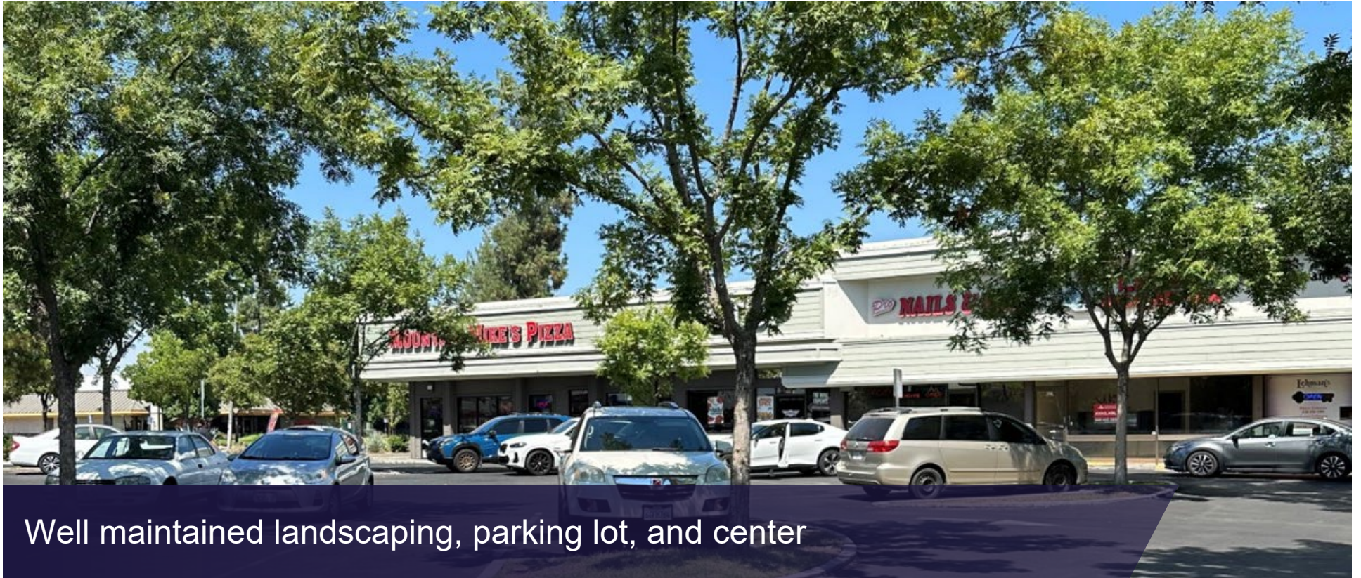
Well maintained landscaping, parking lot, and center