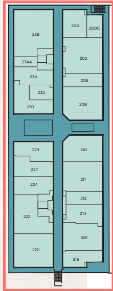
1905 2ND FLOOR