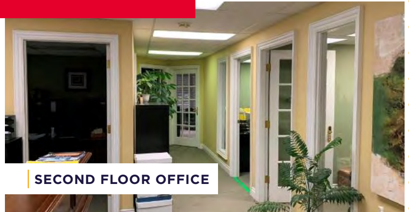
SECOND FLOOR OFFICE