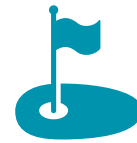
InTown Golf Club