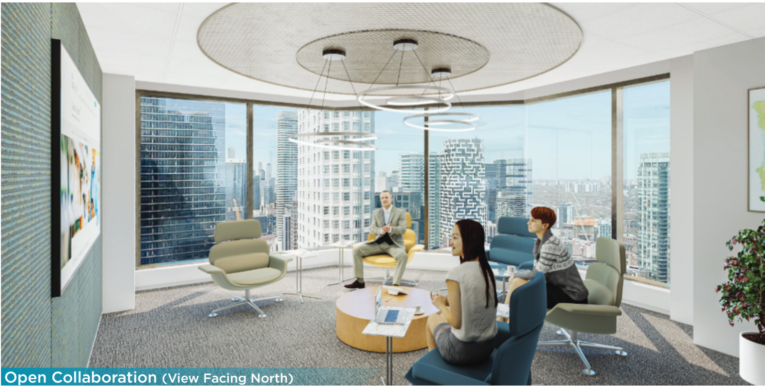
Open Collaboration (View Facing North)