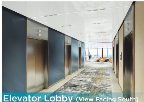
Elevator Lobby (View Facing South)