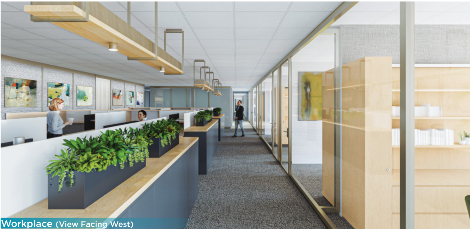
Workplace (View Facing West)