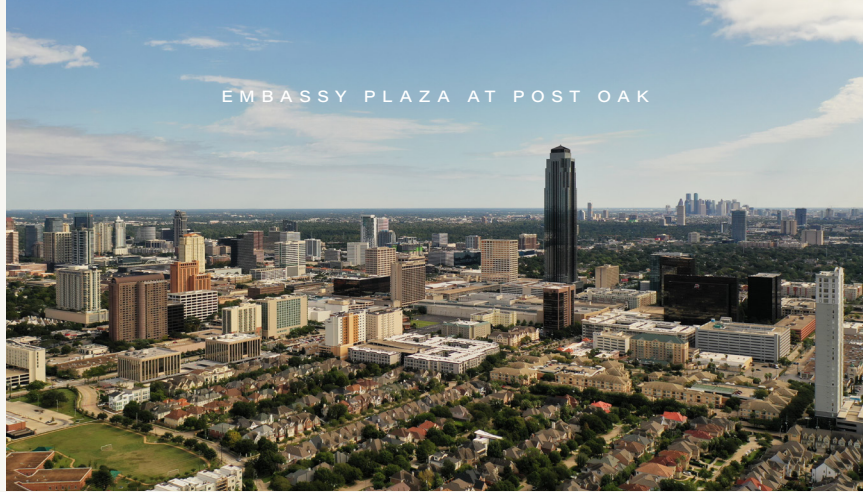
EMBASSY PLAZA AT POST OAK