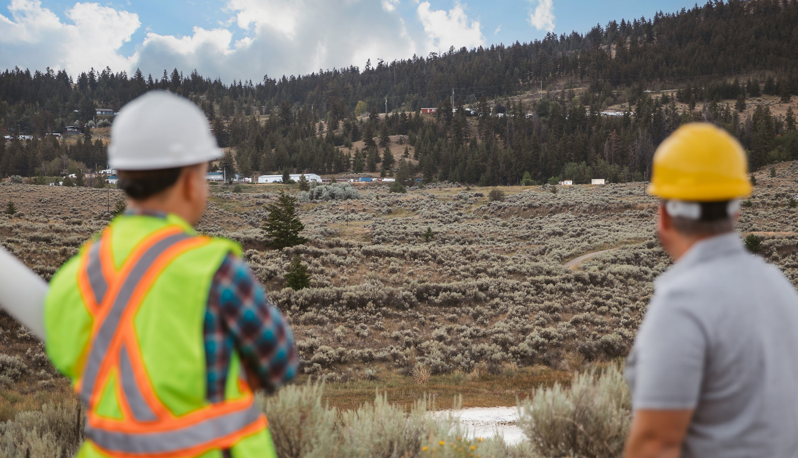
Katelyn Faulkner Photography