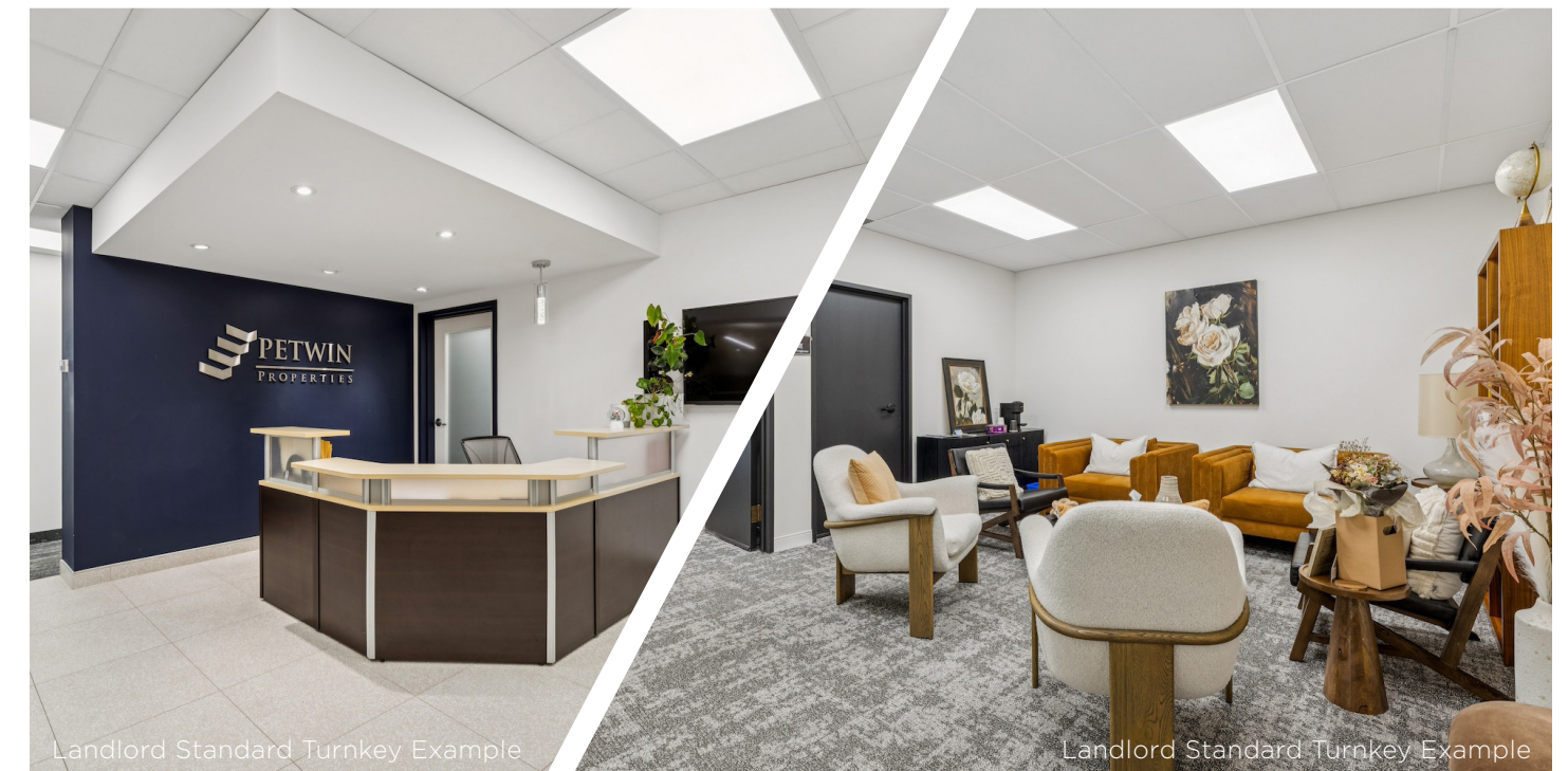
Landlord Standard Turnkey Example