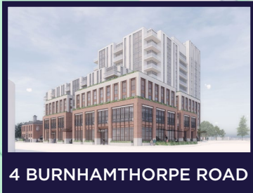
4 BURNHAMTHORPE ROAD