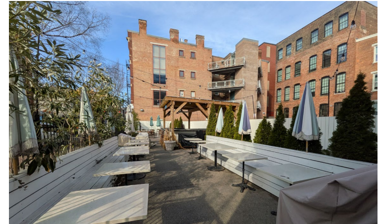
Large Patio on Vine Street