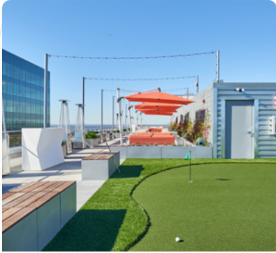
Rooftop Lounge & Putting Green