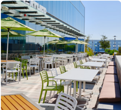
Ample Outdoor Seating