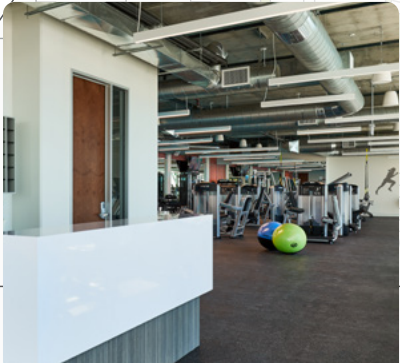
Fitness Center / Yoga Studio