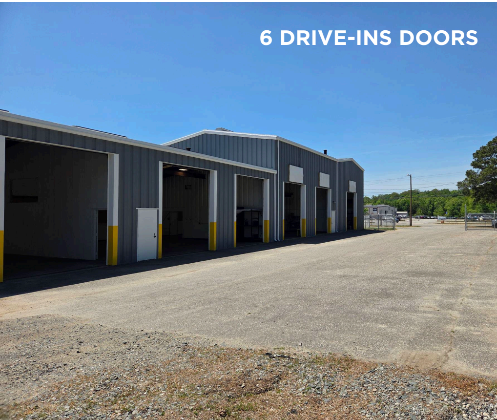
6 DRIVE-INS DOORS