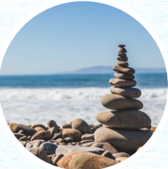
POWERHOUSE BEACH / PARK