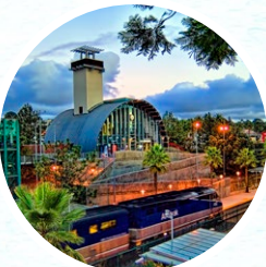
SOLANA BEACH TRAIN STATION