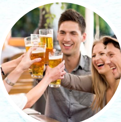
RESTAURANTS & CRAFT BEER