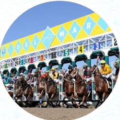
DEL MAR RACE TRACK