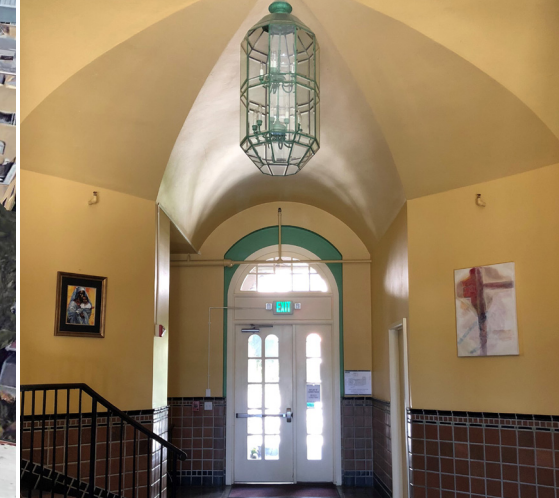
Interior Main Lobby